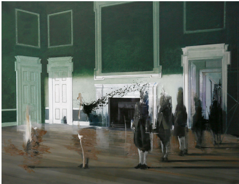
Tim Kent Procession , 2024 Oil on linen 30 1/4 x 39 3/8 in 77 x 100 cm