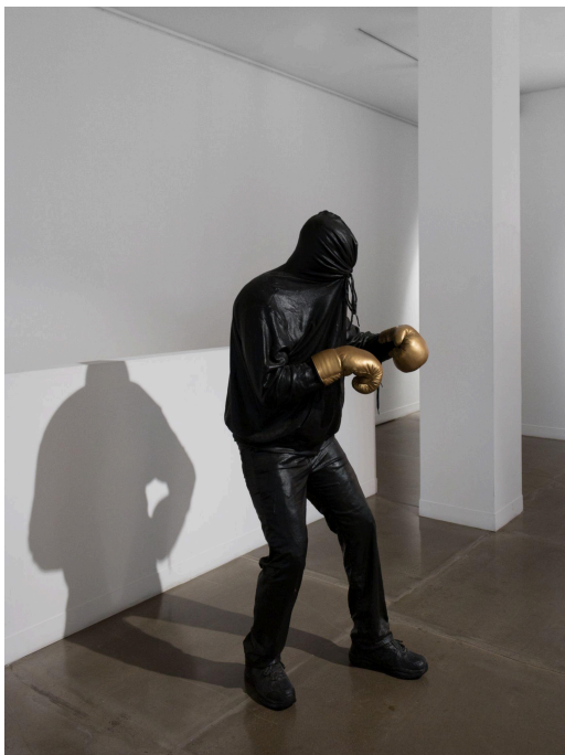
Mark Jenkins The Fighter 2017 Mixed media 68 7/8 x 30 3/4 x 31 1/2 in 175 x 78 x 80 cm