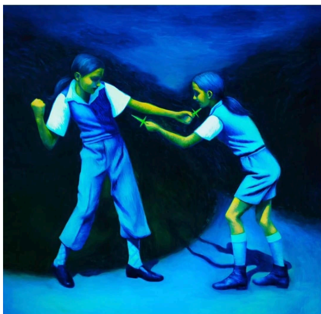
Katia Lifshin Staged fight , 2021 Oil on canvas 23 5/8 x 23 5/8 in 60 x 60 cm