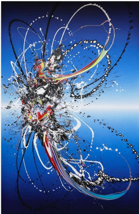
Katrin Fridriks Noble Messenger - Blue Avians Alliance , 2019 Acrylics/Flash 230 x 150 + 10 cm