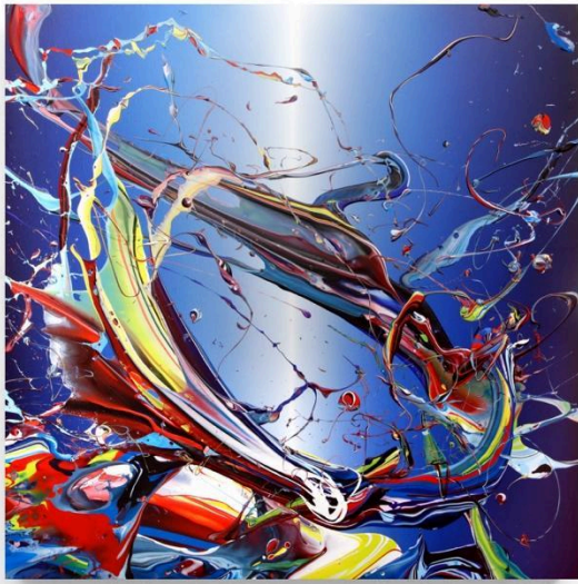
Katrin Fridriks Soul Traveler , 2020 Acrylics on canvas 100 x 100 cm