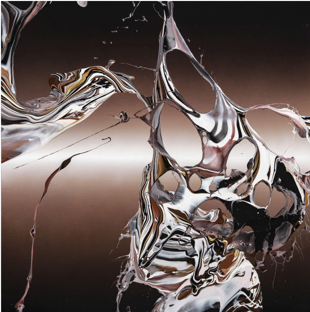
Katrin Fridriks Indigenous Startraveller, 2024 Acrylic on canvas 100 x 100 cm