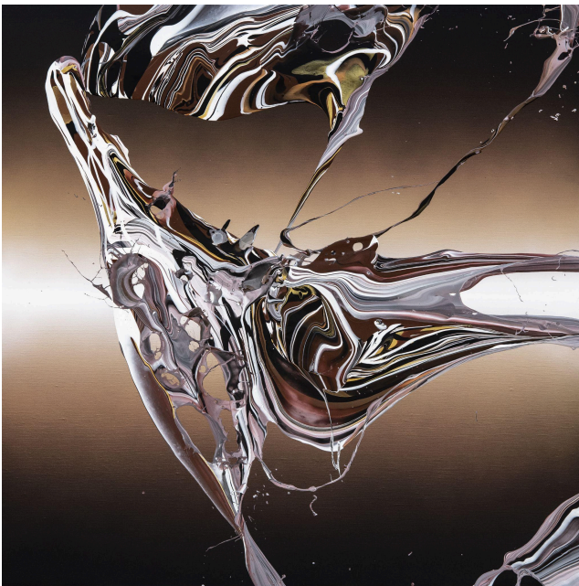
Katrin Fridriks Golden Startrek, 2024 Acrylic on canvas 100 x 100 cm