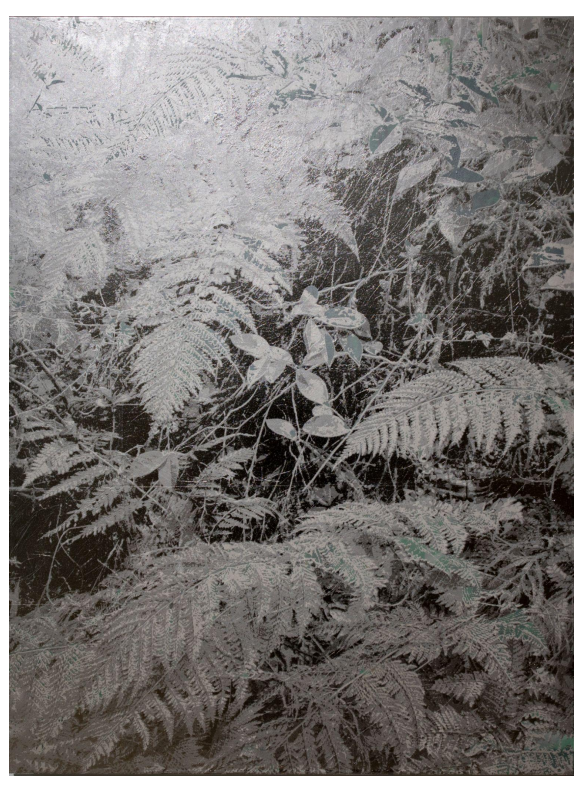
Masayoshi Nojo Untitled, 2019 Cotton on panel, acrylic, silver foil, aluminium foil 80 x 60.5 cm

JD Malat Gallery 30 Davies St, Mayfair, London W1K 4NB +44 20 3746 6830