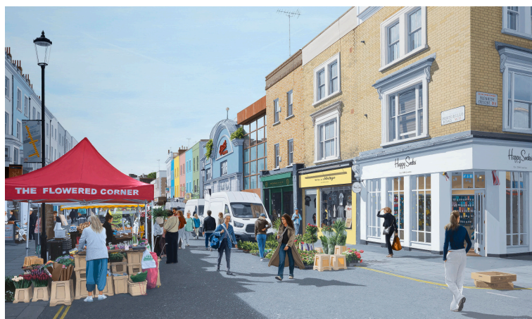
Darren Reid Notting Hill, 2023 Acrylic on panel 65 x 110cm 25 5/8 x 43 1/4 in