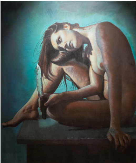
Mark Metcalfe Anima: from the Daughters of Men, 2023 Oil on canvas 71 5/8 x 59 7/8 in 182 x 152 cm