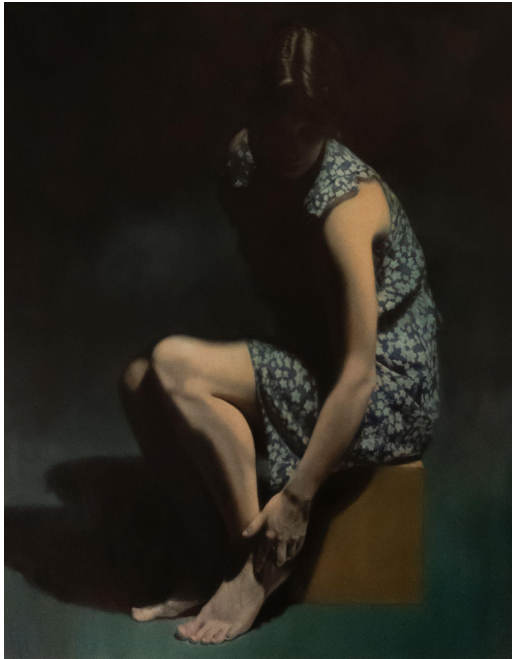
Mark Metcalfe Melancholia: After Durer, 2023 Oil on canvas 60 x 48 in 152.5 x 122 cm