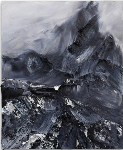
Conrad Jon Godly TO SEE IS NOT TO SPEAK#3, 2018 Oil on canvas 170 x 140cm