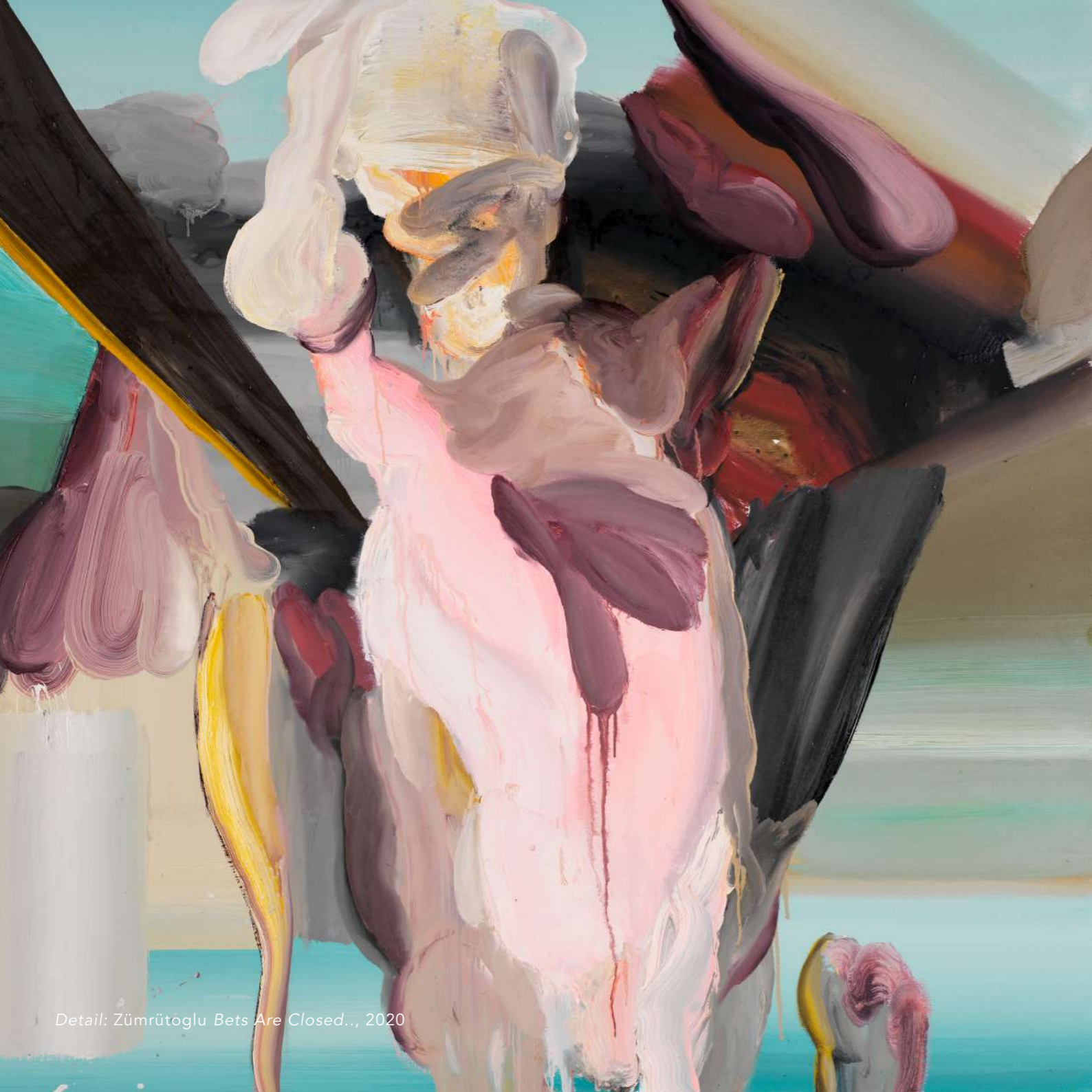
Detail: Zümrütöglu Bets Are Closed.., 2020

This catalogue was produced by JD Malat Gallery for the 16th edition of Contemporary Istanbul 2021