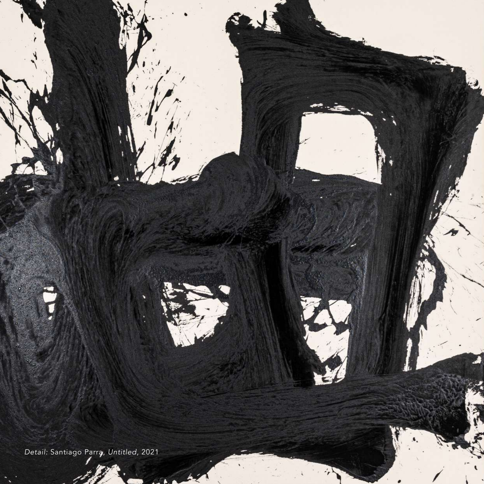
Detail: Santiago Parra, Untitled , 2021

JD Malat Gallery is pleased to present its group show for the 16 th edition of Contemporary Istanbul, bringing together highly expressive works by the following four artists: Turkish artist Zümrütoglu, Colombian artist, Santiago Parra, London-based Ghanaian artist, Kojo Marfo, and Turkish sculptor, Hande Şekerciler,