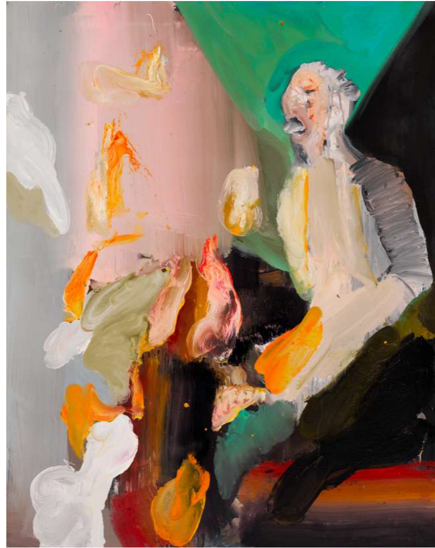
Zümrütöglü Carry On The Game., 2021

Oil on canvas 57 1/2 x 45 5/8 in - 146 x 116 cm