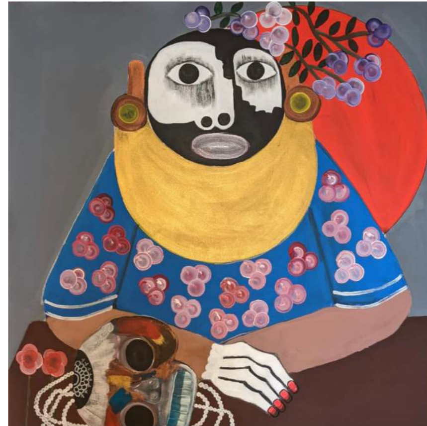
Kojo Marfo New work for Contemporary Istanbul, 2021

Acrylic on canvas 39 3/8 x 39 3/8 in - 100 x 100 cm