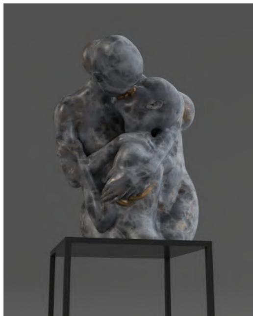
Hande Şekerciler ecstasy no.50, 2021

Bronze with custom made chemical patina 34 1/4 x 24 3/4 x 24 1/8 in - 87 x 63 x 61 cm Edition of 3 plus 1 artist's proof (#1/3)