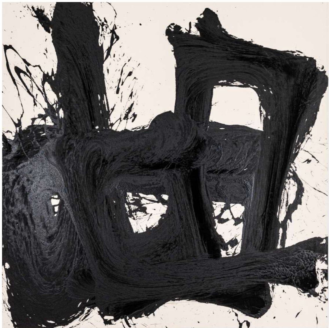
Santiago Parra Untitled, 2021

Acrylic on canvas 78 x 78 in - 198 x 198 cm