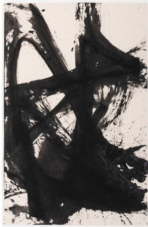
Santiago Parra, Untitled , 2019, Acrylic on Canvas, 170 x 110 cm